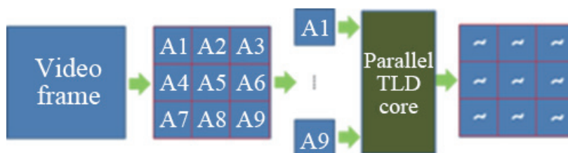
Fig. 2. (Color online) TLD multitarget tracking architecture.