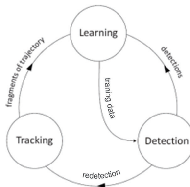
Fig. 1. TLD tracking architecture. (8)

In this paper, the single-target tracking is extended to multitarget tracking based on the TLD algorithm. The trajectory of the tracked object will be recorded to provide the information of the motion state, as well as the direction deviation or posture change of