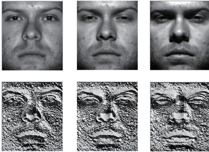
Fig. 2. Comparison of LBP versus illumination.

where W is an n -by- m matrix with orthonormal columns and m < n . Fisherface aims to optimize W and then y_i to improve the image vector classification and face recognition performance. W is then optimized via the introduction of 3 scatter matrices, i.e., the total scatter matrix S_t , the between-class scatter matrix S_b , and the within-class scatter matrix S_w , respectively defined as